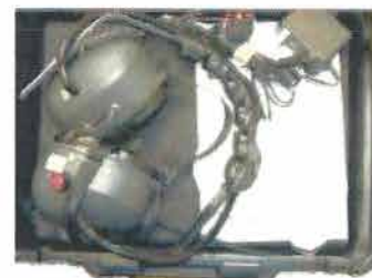
Storing the Series 5

The Series 5 should be stored in its plastic case by placing the headset antennas down and with the microphone up as shown in the picture below. If you store your headset incorrectly, it can cause damage to the antennas and/or the microphone.