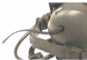
Charging the Series 5

To recharge the headset, plug the power supply that came with your headset (see specs on back page) into the charging jack at the bottom of the receive side. A charge session of 7-8 hours should completely charge the batteries. Charging for longer than that time period may degrade the battery performance. The amber LED next to the charging jack will stay lit as long as the charger is attached and is functioning.